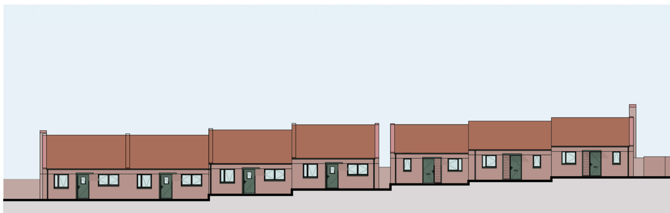
STREET SCENE D-D [SITE C - PLOT 96 COLLIER (4x3)] [SITE C - PLOT 95 COLLIER (4x3)] [SITE C - PLOT 94 COLLIER (4x3)] [SITE C - PLOT 93 COLLIER (4x3)] [SITE C - PLOT 92 18 (4x3)] [SITE C - PLOT 91 18 (4x3)] [SITE C - PLOT 90 18 (4x3)]