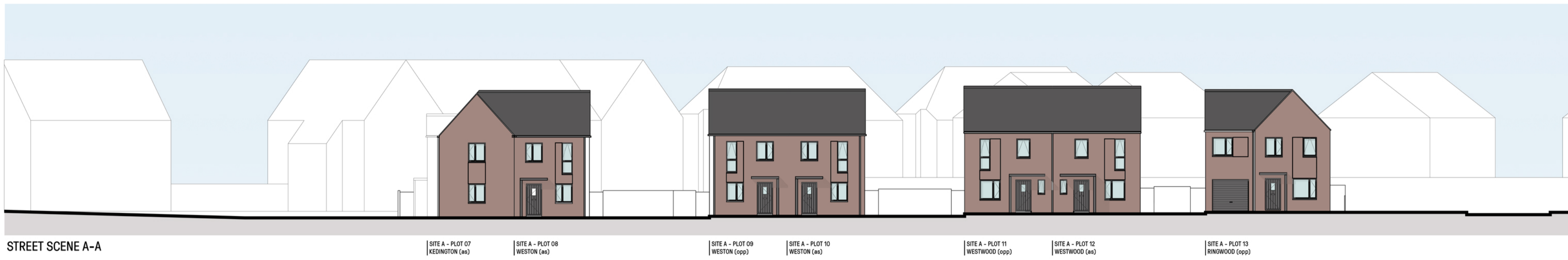
STREET SCENE A-A [SITE A - PLOT 07 KEDINGTON (4x3)] [SITE A - PLOT 08 WESTON (4x3)] [SITE A - PLOT 09 WESTON (4x3)] [SITE A - PLOT 10 WESTON (4x3)] [SITE A - PLOT 11 WESTWOOD (4x3)] [SITE A - PLOT 12 WESTWOOD (4x3)] [SITE A - PLOT 13 BROOKWOOD (4x3)]