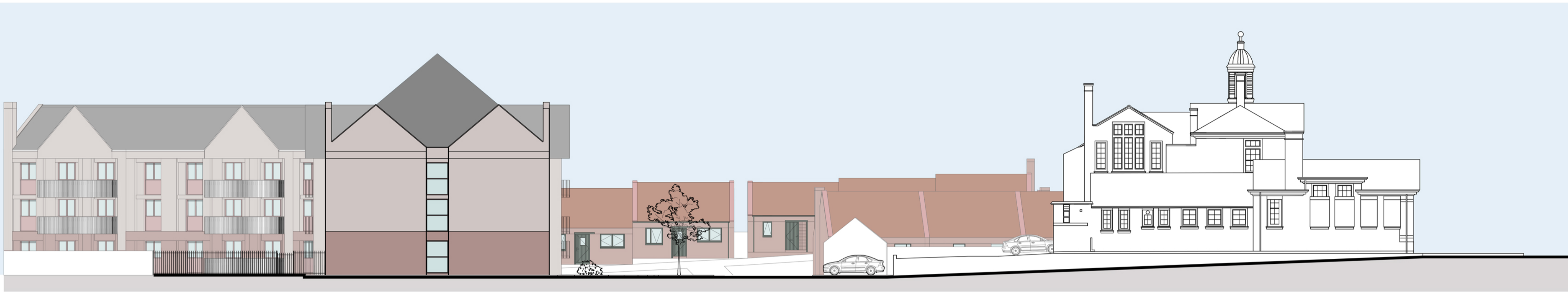
STREET SCENE B-B [SITE B - PLOT 21-88 RETIREMENT LIVING SCHEME] TELFORD COLLEGE King Street Campus