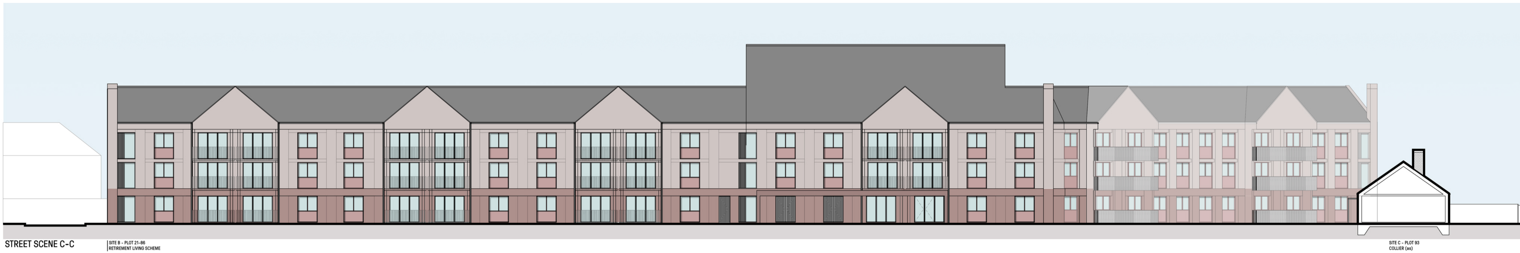
STREET SCENE C-C [SITE B - PLOT 21-88 RETIREMENT LIVING SCHEME] [SITE C - PLOT 93 COLLIER (4x3)]